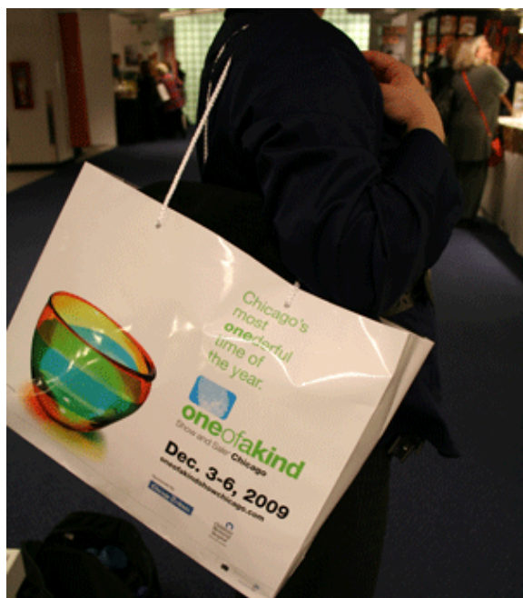
One of a Kind shoppers bag.

and Michelle Shafer at Q3 Art, Inc. dance with subtle air currents. These colorful and textured forms, range from delicate earrings, to patented micro monitor mobiles for easing eye tension at the computer, to larger indoor and outdoor table top or hanging forms.