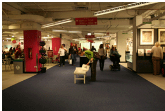
Show Floor.

At the Merchandise Mart December 3 to December 6, 2009, and boasting about five hundred artists and artisans, this year's One of a Kind has something unique for every taste and style. Roaming the eighth floor of the Mart, visitors can find paintings, drawings, clay, glass, and metal sculpture. Gifts for loved ones abounds in the form of jewelry in paper, metal and stone, or hats and headbands, or clothing and even handmade paper clocks with delightful animal faces and moving pendulum tongues.